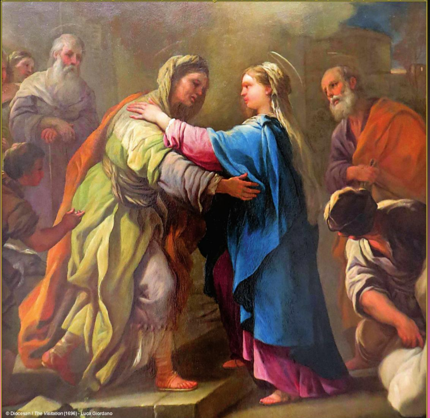
The Visitation (1696) - Luca Giordano